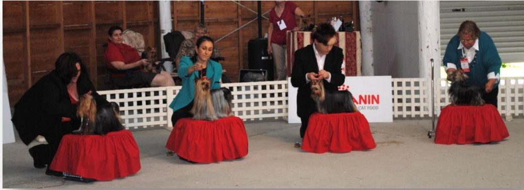
Pictured Challenge Dog Line Up.