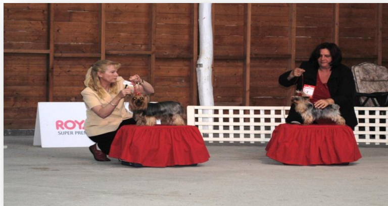
Pictured Veteran's Class