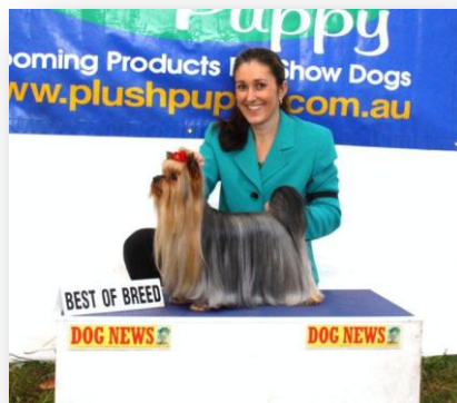
Best of Breed